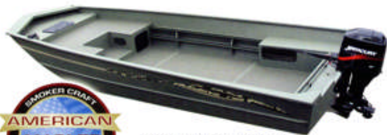
20' SPORTSMAN DLX