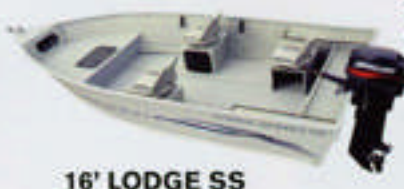
16' LODGE SS