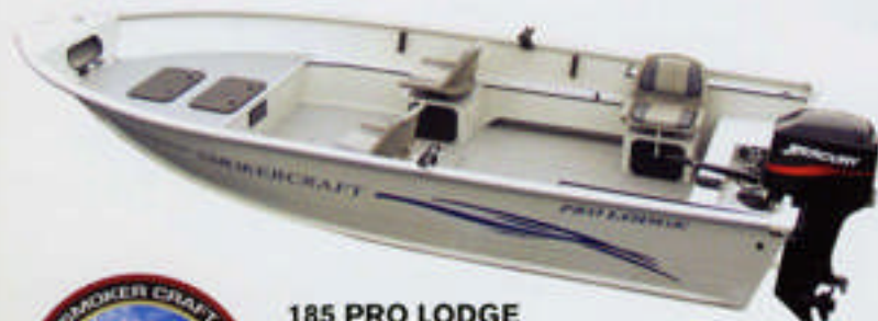
185 PRO LODGE