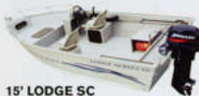
15' LODGE SC