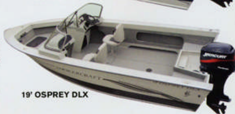
19' OSPREY DLX