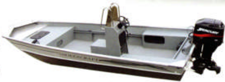
18' SPORTSMAN DLX