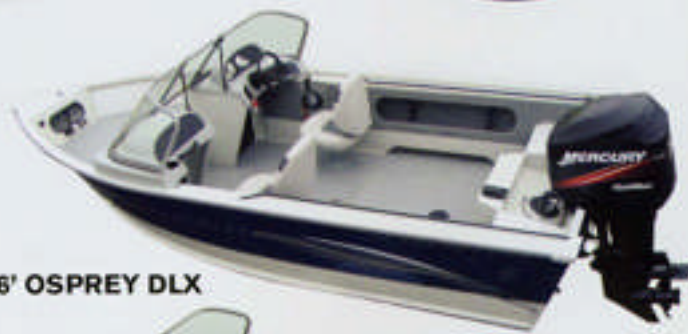
16' OSPREY DLX