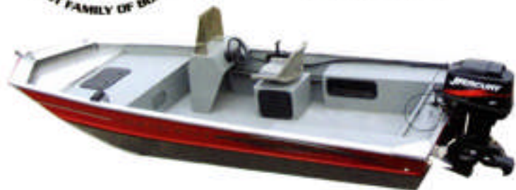
16' SPORTSMAN DLX