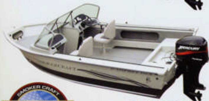
17' OSPREY DLX