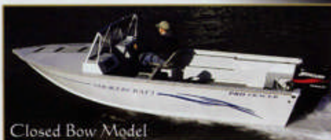
Closed Bow Model