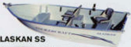
13' ALASKAN SS