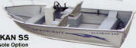
15' ALASKAN SS w/ Side Console Option