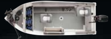
140 Pro Mag [SHOWN WITH OPTIONAL TROLLING MOTOR]