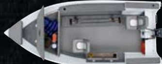
168 Pro Mag