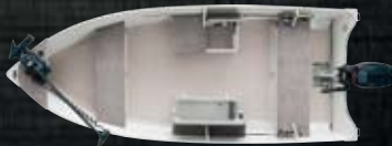
14' Big Fisherman [SHOWN WITH OPTIONAL TROLLING MOTOR]