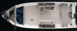
16' Big Fisherman [SHOWN WITH OPTIONAL TROLLING MOTOR]