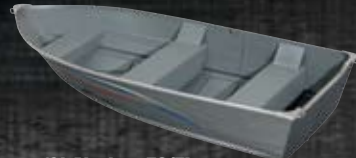
12' Alaskan TS/TL