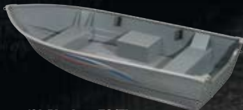
13' Alaskan TS/TL Split Seat DLX