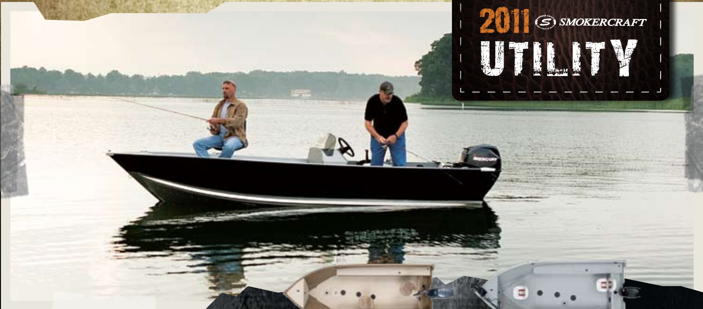
180 Freedom Tiller [ALSO AVAILABLE IN SIDE CONSOLE CONFIGURATION]